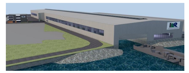
3D-Model of the Trimodal Logistics Center, High Performance Green Port Giurgiu

This gap in transport infrastructure quality, safety and eco-performance between the Western and the Eastern countries ports requires substantial investment, transnational coordination and close cooperation with private sector stakeholders. With the right strategy and measures Danube ports have a huge potential to become efficient nodal hubs of a sustainable transport system and focal points of smart regional economic growth spanning across traditional borders.